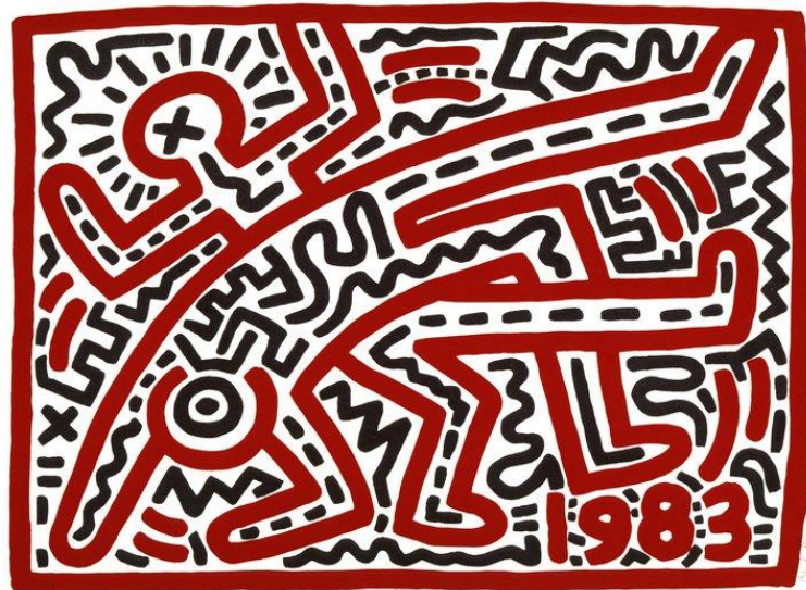
Keith Haring, 1958–1990, Untitled 1983 , Woodcut, 610 x 762 mm, Collection of the Keith Haring Foundation

He often listened to hip-hop music. Break-dancers used his pavement drawings as a surface for their performances. Do you think these figures are dancing to hip hop?