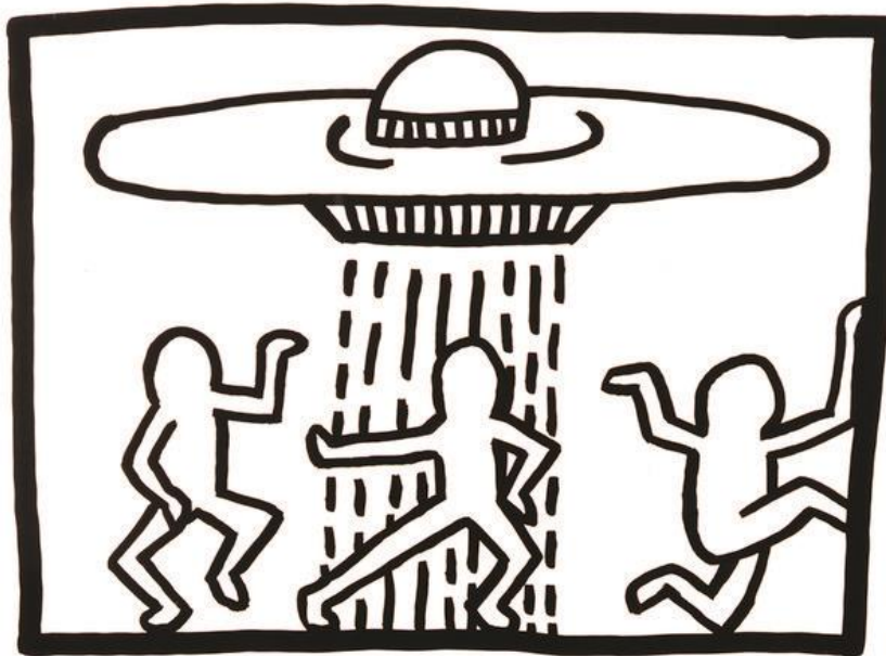
Keith Haring, 1958-1990, Untitled 1980 , Ink on Bristol board, 510 x 660 mm, Collection of the Keith Haring Foundation

Keith Haring is known for colourful, cartoon artworks and certain characters such as crawling babies, barking dogs and spaceships.