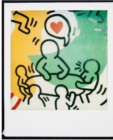
Keith Haring, Boys Club, NYC, August 17, 1987

Step into Keith Haring's world of doodles and be inspired by his awesome artwork!