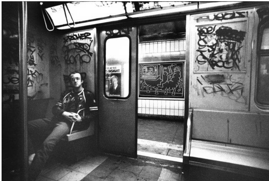
Tseng Kwong Chi Keith Haring in subway car, (New York), circa 1983.

Keith Haring was born in 1958, in Pennsylvania, USA. He loved drawing cartoons and visiting museums. Here he is travelling on the subway.